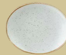
OVAL PLATE SDESOP7 1 19.2cm 7¾" CTN QTY 12 ★