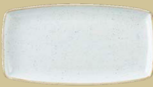
OBLONG PLATE SDESOP141 35 x 18.5cm 14" x 7¼" CTN QTY 6