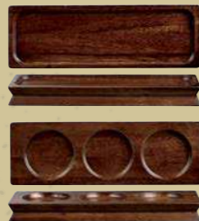
SMALL WOODEN DELI BOARD ZCAWSWBD1 27 x 9cm 10.6" x 3.5" CTN QTY 4