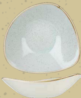
TRIANGULAR BOWL SDESTRB91 23.5cm 9¼" 60cl 21oz CTN QTY 12 SDESTRB71 18.5cm 7¼" 37cl 13oz CTN QTY 12