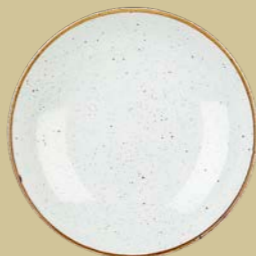
COUPE BOWL SDESEVB91 24.8cm 9¾" 113.6cl 40oz CTN QTY 12 ★