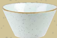
ZEST BOWL SDESZE121 12.1 x 6.5cm 4⅞" x 2½" 34cl 12oz CTN QTY 12