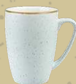
MUG SDESV121 34cl 12oz CTN QTY 12 ★