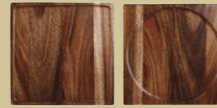
PRESENTATION BOARD ZCAWPB111 30 x 30cm 11 7/8" x 11 7/8" Inset: 27.9cm 11" CTN QTY 4