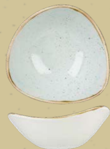
TRIANGULAR BOWL SDESTRB61 15.3cm 6" 26cl 9oz CTN QTY 12