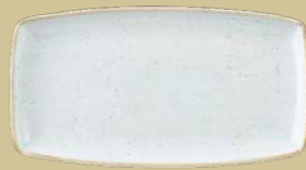
OBLONG PLATE SDESOP111 29.5 x 15cm 11¾" x 6" CTN QTY 12