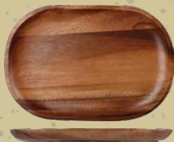
ACACIA MOONSTONE PLATE ZCAWLMBD1 20 x 29cm 7 7/8" x 11 1/2" CTN QTY 4