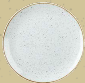
COUPE PLATE SDESEV111 28.8cm 11¼" CTN QTY 12 ★ SDESEV101 26cm 10¼" CTN QTY 12 ★

Hand decorated! Each piece is individual.