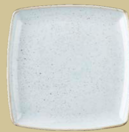
DEEP SQUARE PLATE SDESDS101 26.8cm 10½" CTN QTY 6