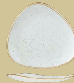
TRIANGLE PLATE SDESTR9 1 22.9cm 9" CTN QTY 12 SDESTR7 1 19.2cm 7¾" CTN QTY 12