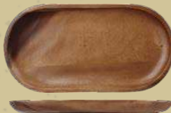
ACACIA MOONSTONE PLATE ZCAWMMBD1 15 x 29cm 5 7/8" x 11 1/2" CTN QTY 4