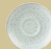
SAUCER SDESS 1 11.8cm 4½" CTN QTY 12 ★