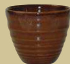
RIPPLE CINNAMON CHIP MUG BCBRRPCM1 9.5 x 8.3cm 3 7/8" x 3 1/4" 28cl 10oz CTN QTY 12