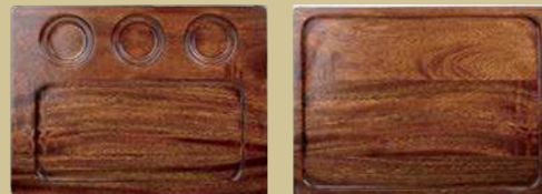
SQUARE WOODEN DELI BOARD ZCAWSDB 1 32 x 24cm 9 5/8" x 12 5/8" CTN QTY 4