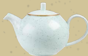
BEVERAGE POT SDESB151 42.6cl 15oz CTN QTY 4