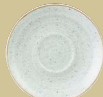
SAUCER SDESCSS 1 15.6cm 6¼" CTN QTY 12 ★