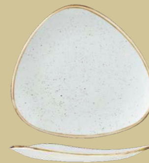
TRIANGLE PLATE SDESTR121 31.1cm 12¼" CTN QTY 6 SDESTR101 26.5cm 10½" CTN QTY 12