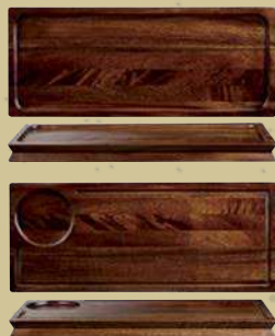
LARGE WOODEN DELI BOARD ZCAWWBDD1 40 x 16.5cm 15.9" x 6.5" CTN QTY 4