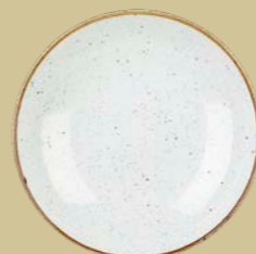
COUPE BOWL SDESEVB71 18.2cm 7¼" 42.6cl 15oz CTN QTY 12 ★