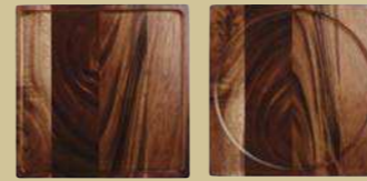
PRESENTATION BOARD ZCAWPB121 33.5 x 33.5cm 13 3/8" x 13 3/8" Inset: 31.75cm 12 1/2" CTN QTY 4