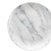
GREY MARBLE COUPE PLATE MGY EV101 26cm 10 1/4" CTN QTY 6