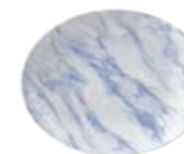
BLUE MARBLE OVAL COUPE PLATE MBL OP121 31.7 x 25.5cm 12 1/2" x 10" CTN QTY 6