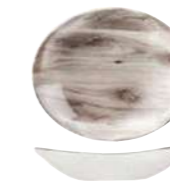
SEPIA WOOD OVAL COUPE BOWL WSE OB101 25.5 x 21.2cm 10" x 8 1/4" 59.6cl 21oz CTN QTY 6