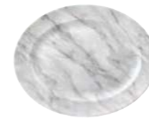
GREY MARBLE OVAL RIMMED DISH MGY RD141 36.5 x 29.3cm 14 1/8" x 11 1/2" CTN QTY 6

Designed to mix with current collections to create an eclectic feel. Nature's designs and colours combine to bring the natural world to the tabletop. The classic texture of marble is enhanced in tones of blue and grey, whilst the modern wood design is available in a stylish sepia or fresh green. The manufacturing process is taken from traditional techniques, with technological investment this provides a durable and strong finish.