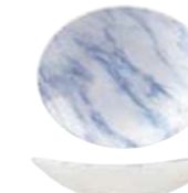
BLUE MARBLE OVAL COUPE BOWL MBL OB101 25.5 x 21.2cm 10" x 8 1/4" 59.6cl 21oz CTN QTY 6