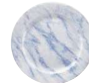
BLUE MARBLE PLATE MBL VP111 30.5cm 12" CTN QTY 6