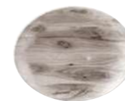
SEPIA WOOD OVAL COUPE PLATE WSE OP121 31.7 x 25.5cm 12 1/2" x 10" CTN QTY 6